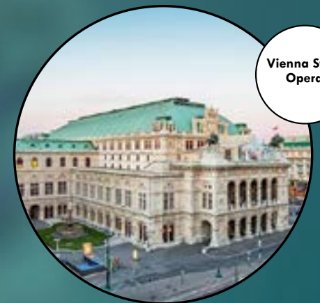
Vienna State Opera

Theme: "Exploring the Pharmacological Future of Ethnomedicine"